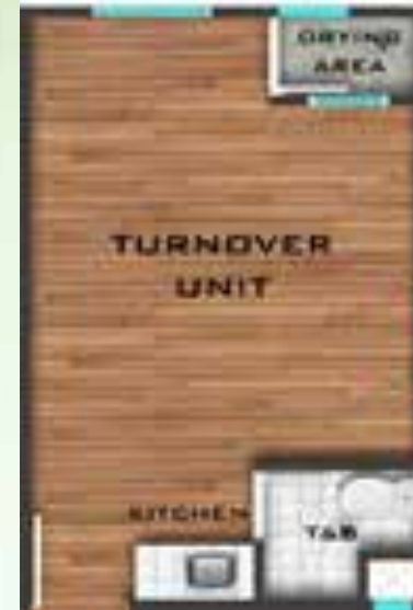
Typical 24-sqm Turnover Unit