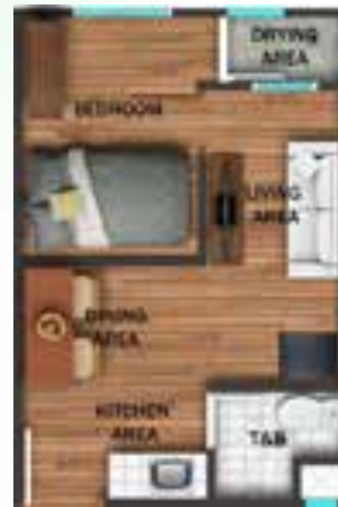
Typical 24-sqm Suggested Layout