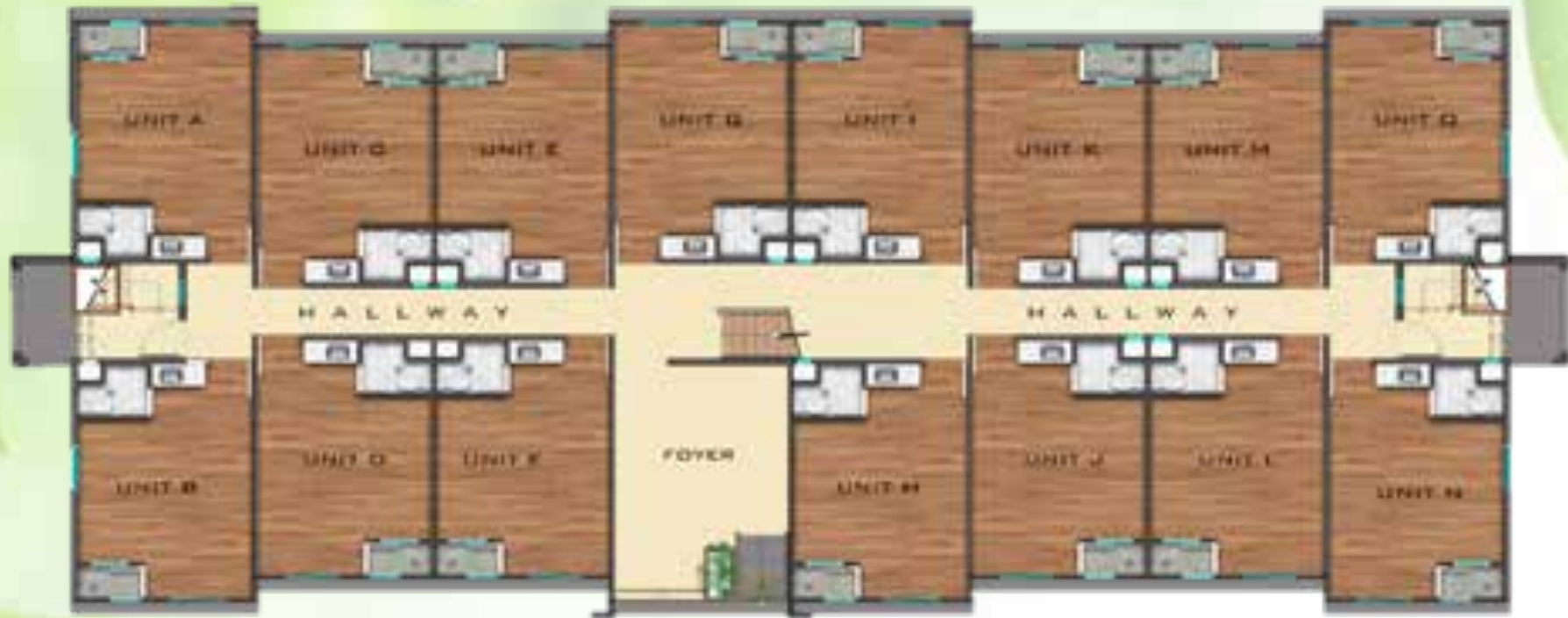
(APPLICABLE TO BUILDING 5) GROUND FLOOR PLAN